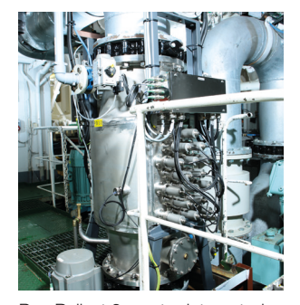
PureBallast 3 reactor integrated into pipework after installation.

Crew training, budgeting assistance and even financing options are available.