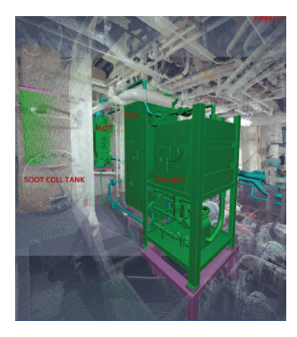
3D laser scans allowing exact positioning of PureBallast 3 components.

Alfa Laval reserves the right to change specifications without prior notification.