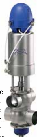
Image 1: Alfa Laval Unique Mixproof SeatClean is the choice for standard installations that handle products with solids. Seat lift during normal cleaning procedures cleans the plugs and seats.

such as Alfa Laval Unique Mixproof valves, make it possible to inspect only one valve after a given number of seat lifts to validate the cleaning program for the entire installation. Validating the cleaning program when the seat lift is adjustable, on the other hand, is a labour-intensive and time-consuming process because every valve requires adjustment and subsequent inspection. • Has a very fast-acting actuator that requires a small air volume to perform seat lift and seat push cleaning operations and locally situated solenoid valves to optimize the cleaning process.